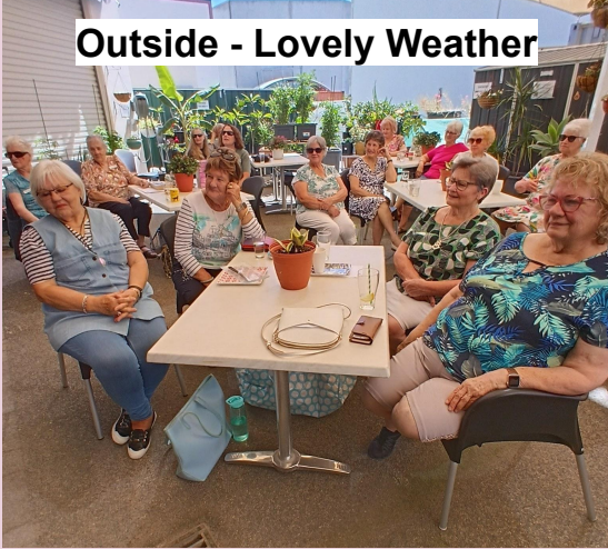
Outside - Lovely Weather