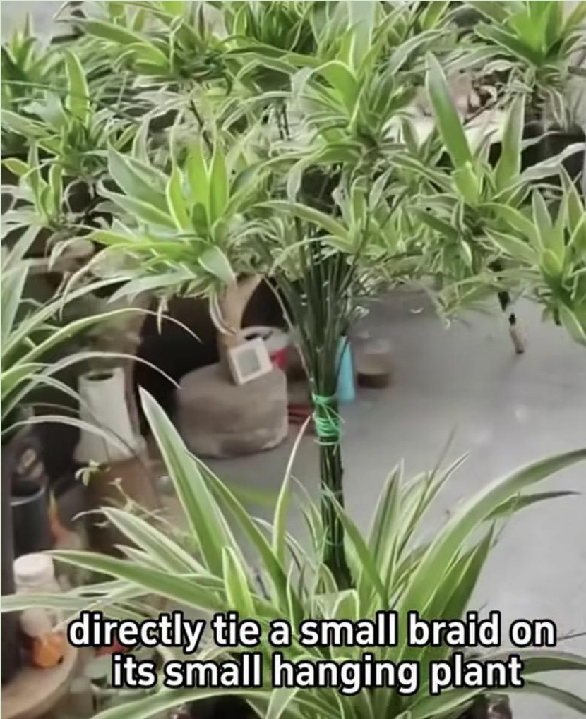
directly tie a small braid on its small hanging plant