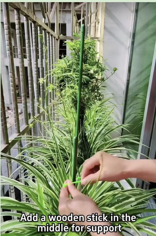
Add a wooden stick in the middle for support