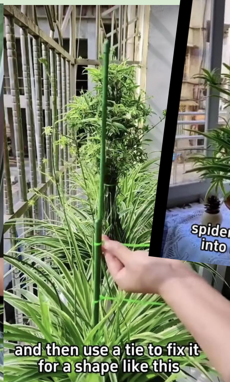
and then use a tie to fix it for a shape like this