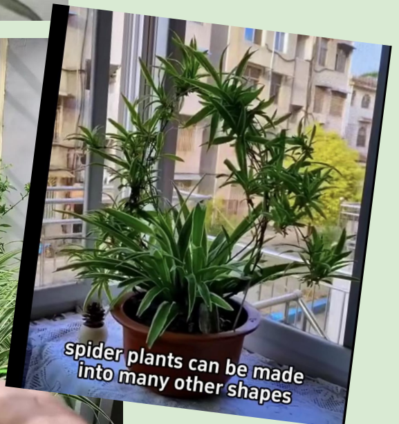
spider plants can be made into many other shapes