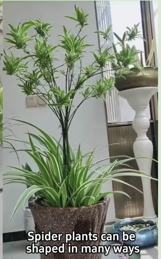
Spider plants can be shaped in many ways